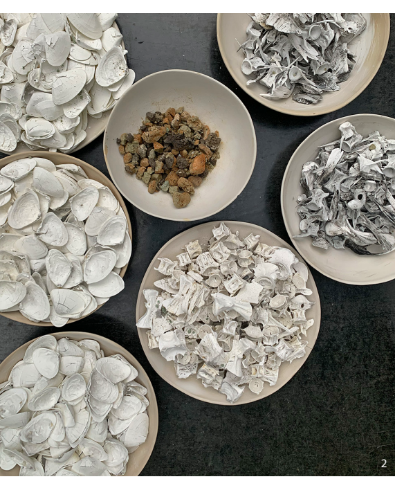
1 Leia Sherblom, shopping trolley kiln for calcining 2 Leia Sherblom, calcined shells and bones

By chefs sharing their day-to-day experience, potters became witness to new concerns including kitchen waste; and much like tackling waste in the studio, many potters sought to address these environmental concerns in the chef's creative space. Discarded glass bottles, animal bone, oyster shell and eggshell found their way into the studio, and after extensive experimentation and development, these waste materials became key elements in glaze and clay recipes for some exhibiting artists; solving problems for both potter and chef.